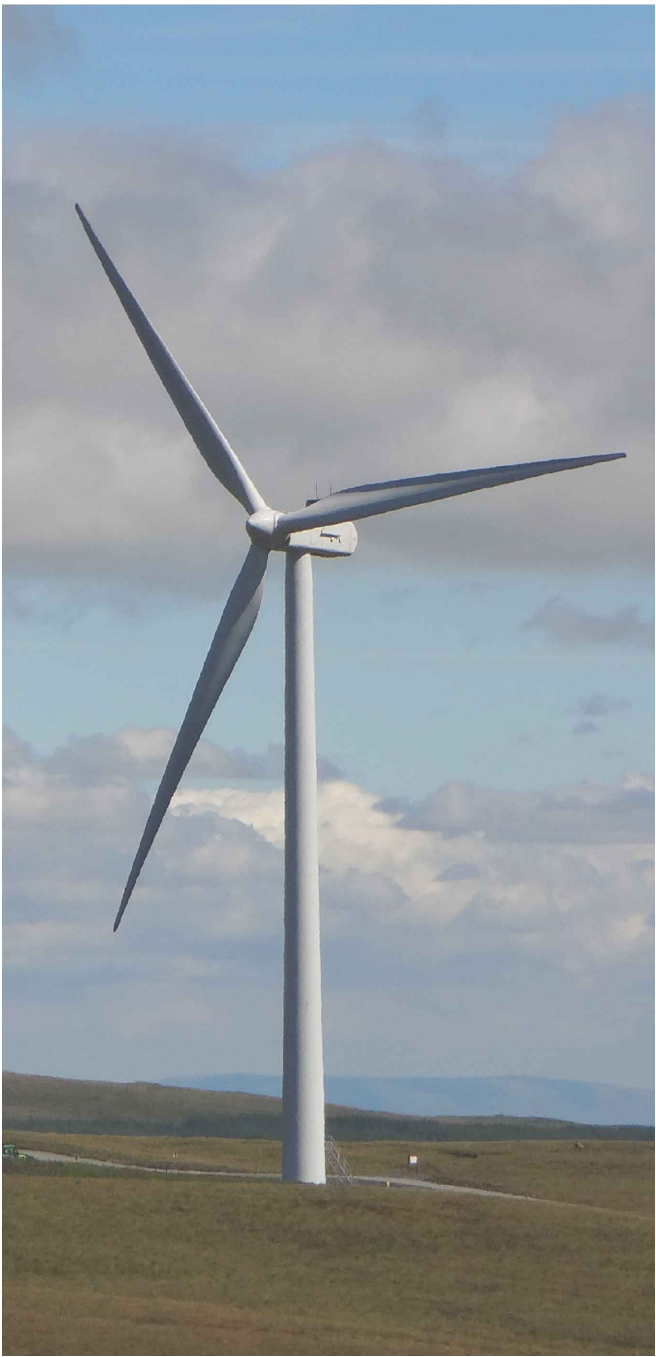
PHOTOGRAPH OF TYPICAL TURBINE